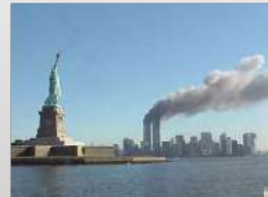
NEW YORK 2001